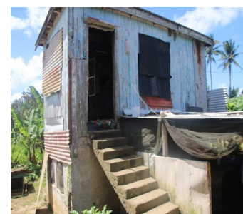
Access to Milika's home